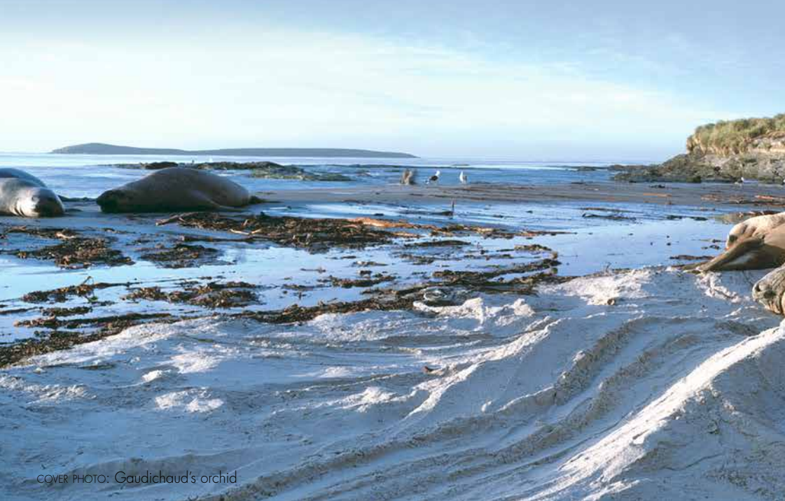
COVER PHOTO: Gaudichaud's orchid