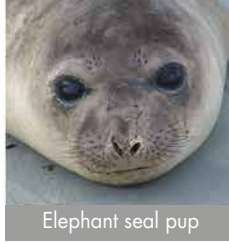
Elephant seal pup

On Sea Lion Island they still breed in small numbers around the coast. They sometimes prey on penguins, but their main food is octopus, squid, lobster krill and fish. Be especially alert when walking through tussac grass where these large animals often haul out.