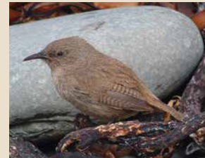
Cobb's wren, unique to the Falklands

To prevent the spread of invasive species and diseases, you are asked to comply with a few simple measures when travelling around the islands: make sure all of your clothing, equipment and luggage is free from soil, animal faeces, seeds, insects and rodents, and scrub your footwear before each visit to a new wildlife site or seabird colony. If you have any questions about biosecurity, or wish to report diseased wildlife, please speak to the landowners or call the Department of Agriculture 27355 / Falklands Conservation 22247 for advice.