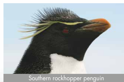
Southern rockhopper penguin